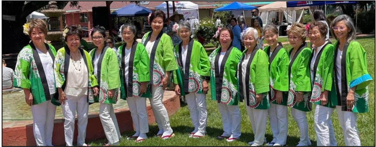
On May 22, 2023, during Asian American Pacific Islander Heritage Month, the SFV Meiji Ondo performed at the Museum of San Fernando in the Pan-Asian Arts & Cultural Festival.