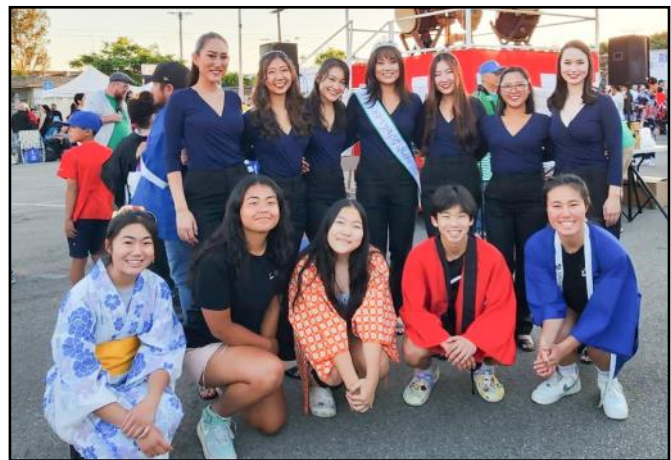
Yonsei 30 players with Nisei Week Court.